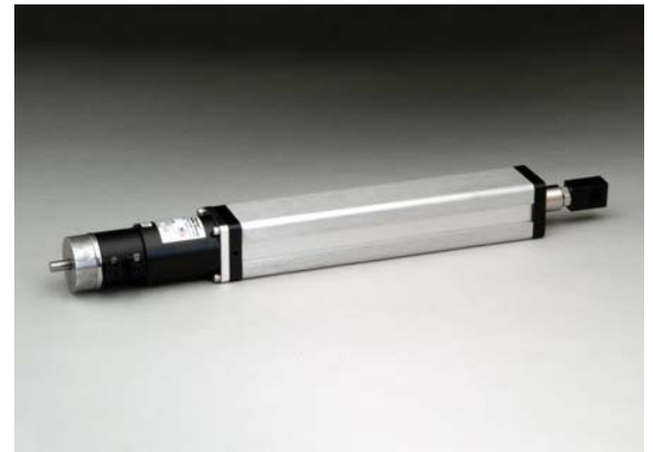
Direct drive version pictured

The MS400 Linear Actuator is ideal where accurate positioning is a requirement. Thrust up to 400 lbs. (1780 N) and speeds to 30 in/sec (762 mm/sec) makes it a perfect choice to replace pneumatic or hydraulic actuators in applications requiring multiple positions. It is available with either a DC Brush or AC Brushless servomotor, allowing easy integration with your overall machine control. The stainless steel translation tube and wiper seal insures years of trouble free operation. With multiple mounting options available there is no need to build custom brackets.