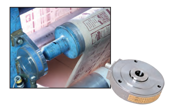
"The Ultra Slim Cells are so much more responsive. We are able to accelerate to the limit and the tension is dead on. Plus we have experienced absolutely no noise and no drift."