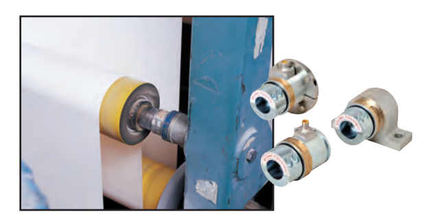
"The Ultra gives us the expanded range that our customers require. I hadn't known that a load cell with the Ultra's 40:1 tension range existed. It is incredible. The Ultra passed all our tests with flying colors, and we are now incorporating it as a standard on our flexographic printing presses."